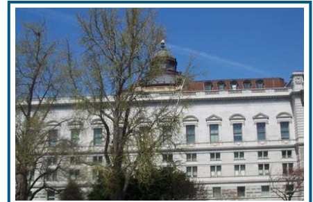
The Library of Congress was a legacy of Thomas Jefferson.

Our speaker is yours truly. As many of you may know, I have spent a large part of the last year in Washington DC, designing and implementing a computer system to preserve "the institutional memory of Congress" for the Congressional Research Service, part of the Library of Congress. In this role, I have had a rare opportunity to learn about the Library, the workings of Capitol Hill and the real impact that 9/11 had. This work was contracted to Compaq Computer Corp, which was acquired by Hewlett-Packard during this period. I'll discuss the merger a bit as well. I think you'll find the talk interesting....but admittedly; I'm partial to the speaker