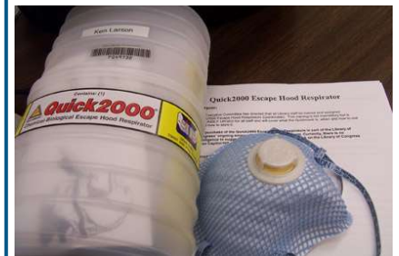
Bio-Chemical Escape Respirator issued to workers on Capitol Hill.