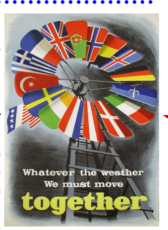
Poster Promoting the Marshall Plan

One decision that was made in those post war days was to make a major investment in rebuilding the infrastructure of Europe. By the time it was completed, the economies of the participating countries had grown well past the prewar levels. Norway was no exception. An estimated $250 million in grants and loans was given to Norway alone between 1947 and 1952; the highest per capita aid given in the plan. That is almost $2.5 billion is today's dollars.