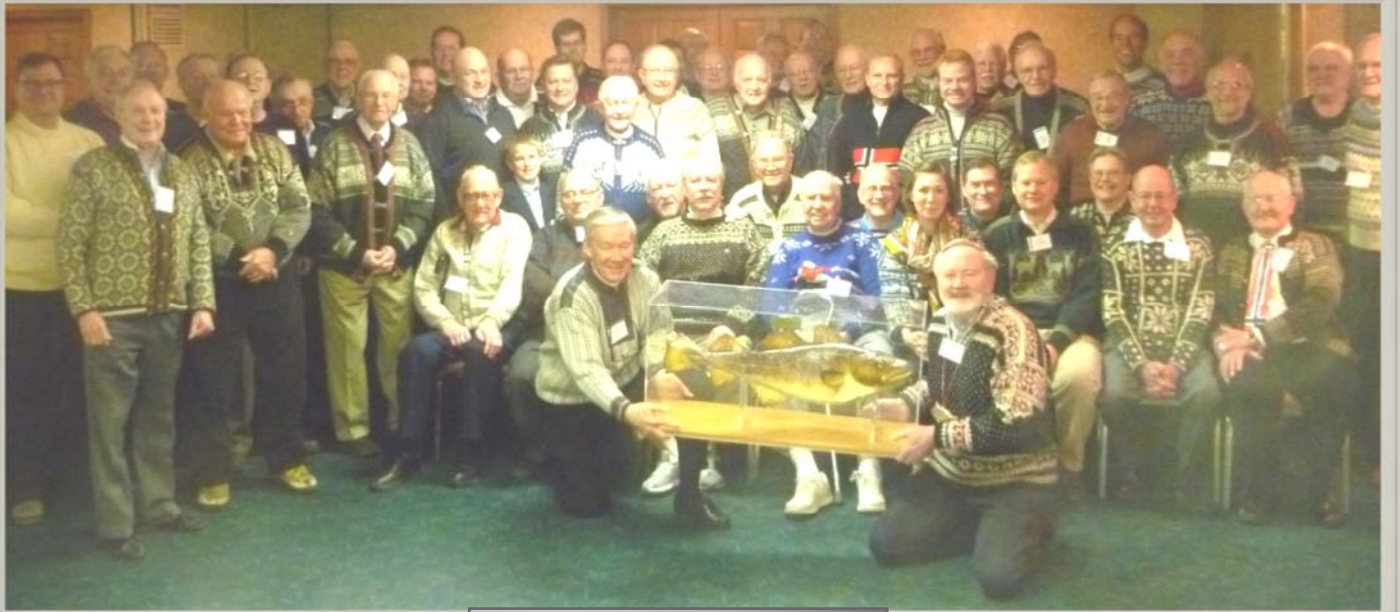
The Chicago Torske Klub –2015