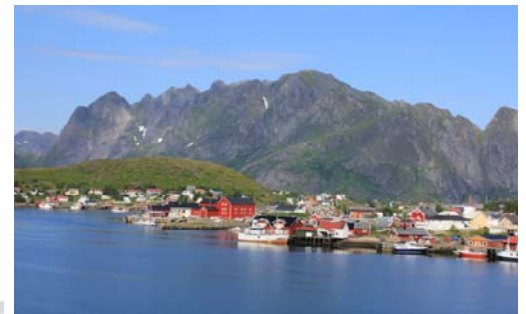
Svolvær in Lofoten Islands, Norway