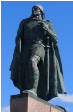
Leif Erikson Statue in Iceland