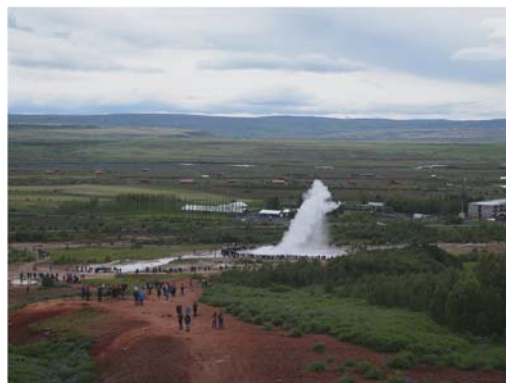
Geyser in Iceland