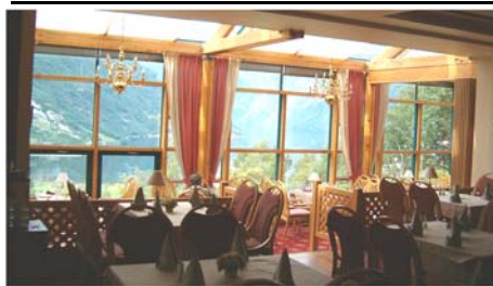
Union Hotel overlooking Geirangerfjord in Norway