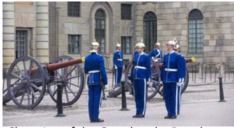
Changing of the Guard at the Royal Palace in Gamla Stan, Stockholm