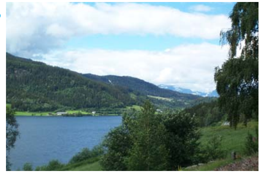
Valdres Valley in central Norway