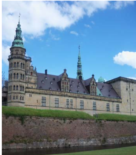
Kronberg Castle in Denmark. The model for Shakespeare's Elsinore