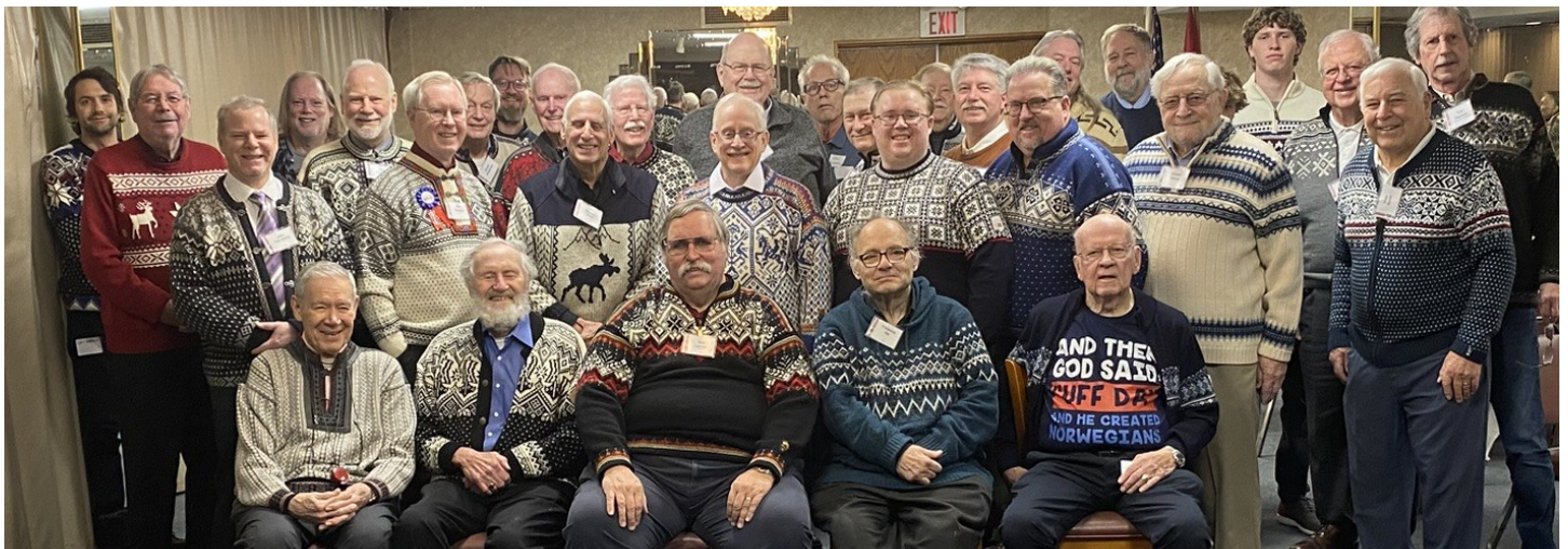
January attendees showing off their sweaters for sweater month. For a better view go to www.torskeklub.com in the Current Newsletter category.

The Elks Lodge is making available to physically challenged members access to the large banquet room via the outside stairs. If you come too early the door may still be locked and you'll still need to use the elevator inside the lobby. It should be unlocked after 11:45am. Give it a try. Coat racks are downstairs in the banquet room facilities.